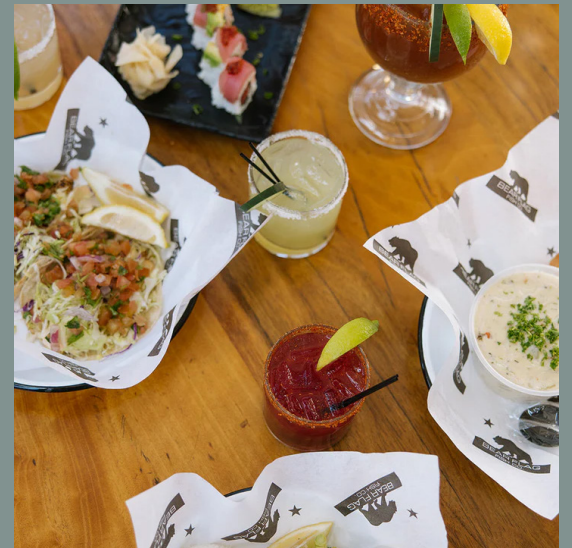
BEAR FLAG (COMING SOON)