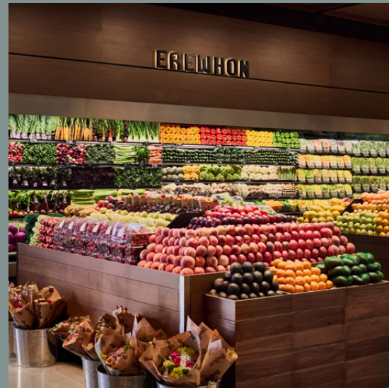
EREWHON (COMING SOON)