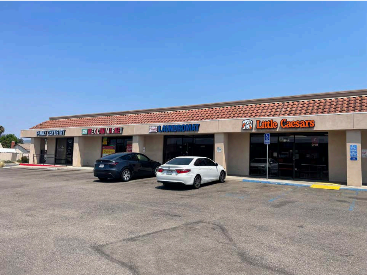
MIRA MESA / CALIFORNIA