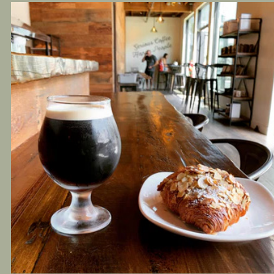
BAREFOOT COFFEE ROASTERS