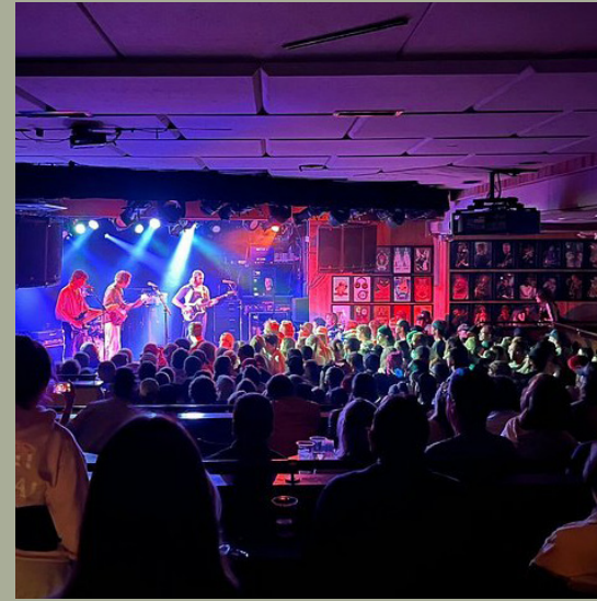
BELLY UP TAVERN