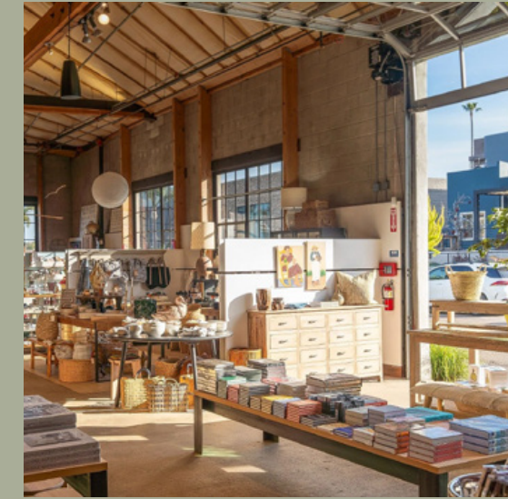
SOLO ON CEDROS