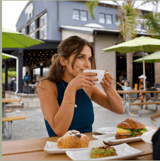
LOFTY COFFEE CO.