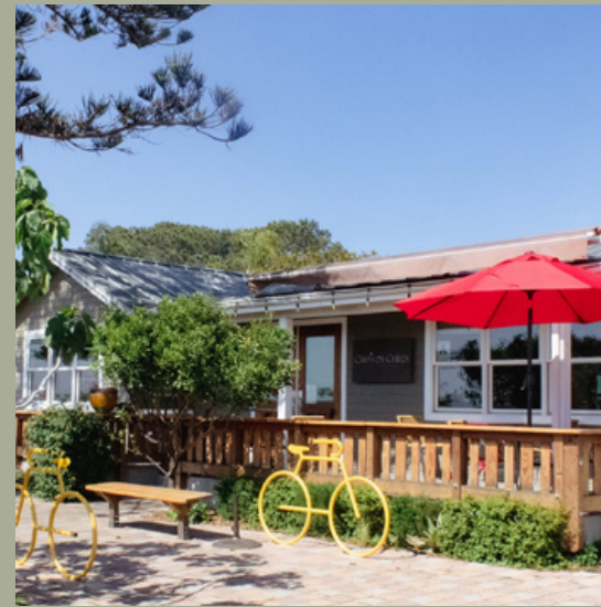
CLAIRE'S ON CEDROS